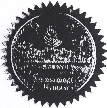
James H. Douglas Governor

Given under my hand and the Great Seal of the State of Vermont this 20 th day of June, A.D. 2008.