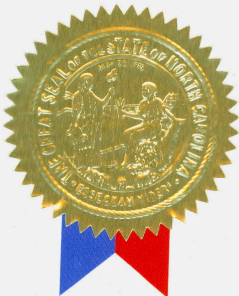
BEVERLY EAVES PERDUE

NOW, THEREFORE, I, BEVERLY EAVES PERDUE, Governor of the State of North Carolina, do hereby proclaim June 21-27, 2010, as "NORTH CAROLINA POLLINATORS WEEK" in North Carolina and commend its observance to all our citizens.